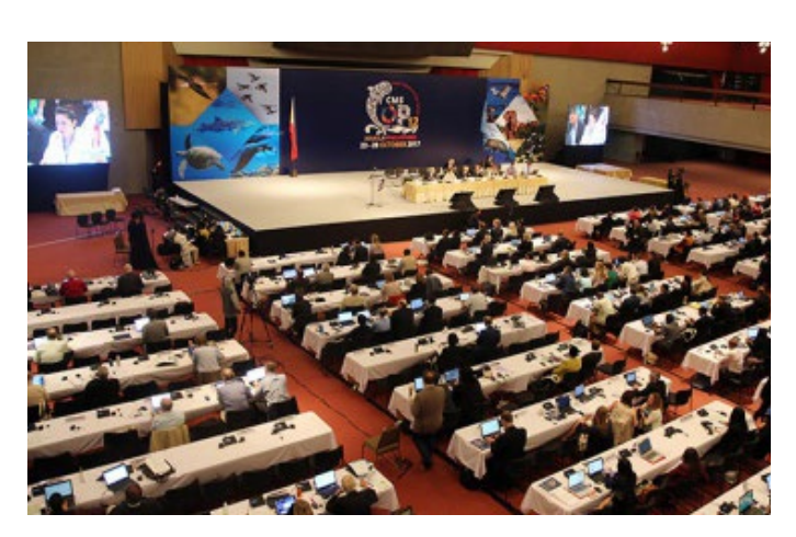
limited resources should be prioritised on more pressing conservation problems.

During the discussions, South Africa, Zimbabwe, Uganda and Tanzania rejected the listing of these species. For Appendix II listing under CMS, the migratory status should be defined based on the characteristics of cyclical and predictable movements of a significant proportion of the population, across one or more national borders.