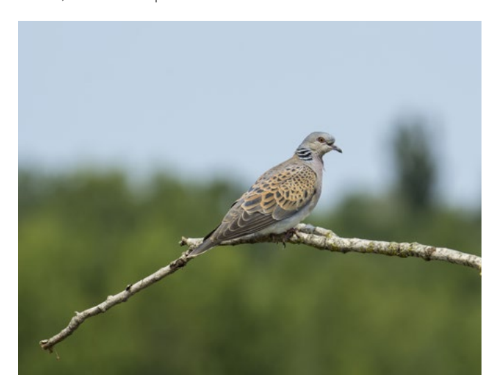
EuroSAP is a LIFE preparatory project, co-financed by the European Commission Directorate General for the Environment, by the African-Eurasian Migratory Waterbird Agreement (AEWA), and by each of the project partners.

During 2017, FACE played an important role in advising on the development of species action plans for the European Turtle Dove and Velvet Scoter as well as a multispecies action plan for wet grassland breeding waders, including: Northern Lapwing, Eurasian Oystercatcher, Black-tailed Godwit, Eurasian Curlew, Ruff, Common Redshank, Baltic Dunlin, Common Snipe.